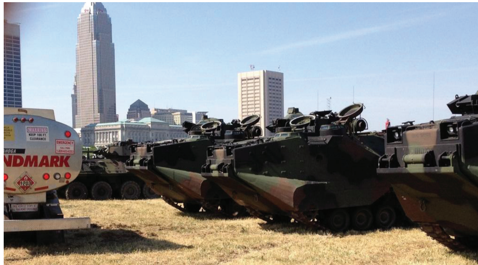
Landmark Fueling US Military Vehicles

In addition, our fueling service has been extremely effective in keeping emergency utility crews working during emergency outages.